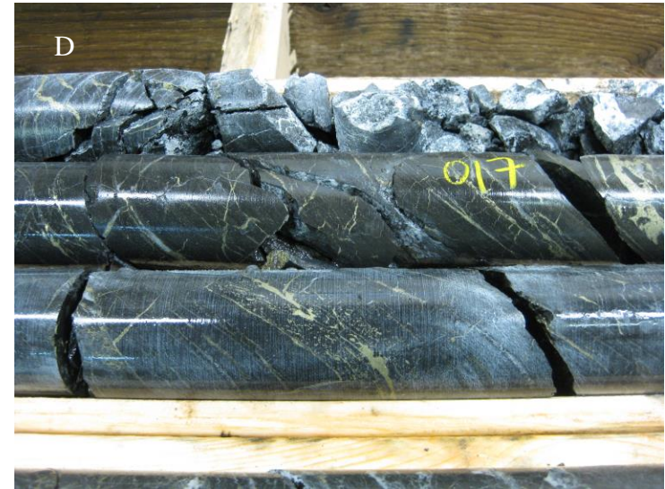
Plate A: Semi-massive to massive chalcopyrite in argillites Plate B: Nodule style chalcopyrite in argillites Plate C: Random/cross-cutting chalcopyrite stringers/veinlets Plate D: disseminated to stringer chalcopyrite conforming to bedding