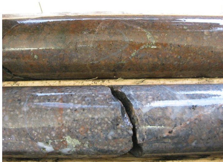
Copper mineralization within feldspar porphyry

Feldspar porphyry dikes are spatially associated with the mineralization and intrude both the mineralized argillites and volcaniclastic host rocks. These dikes are generally weakly altered and contain trace to 1% disseminated chalcopyrite mineralization within late quartz structures. Feldspar porphyry dikes are spatially associated with the mineralization and intrude both the mineralized argillites and volcaniclastic host rocks. These dikes are generally weakly altered and contain trace to 1% disseminated chalcopyrite mineralization within late quartz structures.