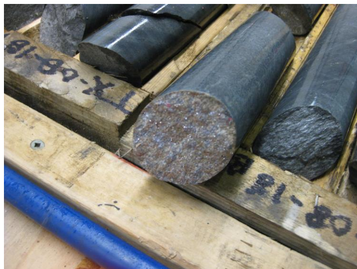
Lead/zinc mineralization along thin veinlet

Minor galena and sphalerite has been found within thin late quartz-carbonate stringers/veinlets adding anomalous grades of lead and zinc respectively. The base metal numbers generally lie within the dacites, outside of the sediment package that hosts the copper mineralization.